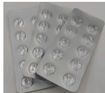
Image of PTP sheets after molding

Japan's Ministry of Economy, Trade and Industry has announced its Green Growth Strategy for achieving carbon neutrality by 2050, which aims to reduce and replace fossil-fuel derived plastics with biomass-derived plastics. The pharmaceutical industry utilizes approximately 14,000 tons* 2 of PTP sheets for tablet medication annually. One of the industry's current challenges is to substitute pharmaceutical plastic packaging material with biomass-derived plastics in order to reduce CO2 emissions.