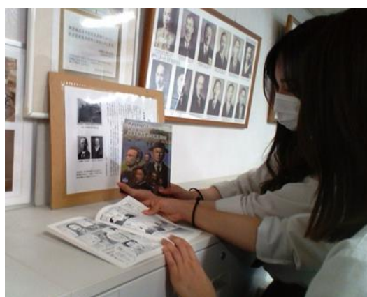
[Students from Shinko Tachibana Senior High School reading the manga]