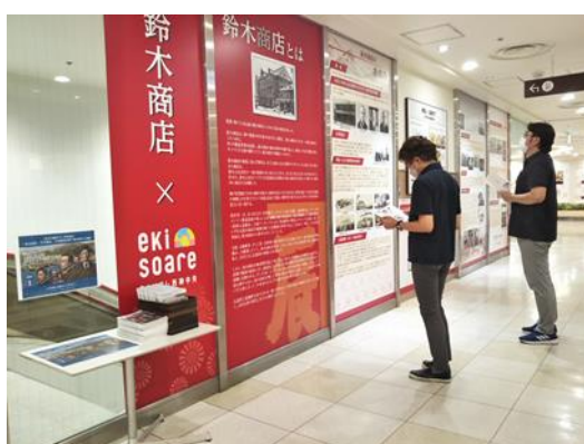
[Customers at Eki Soare being introduced to the manga]