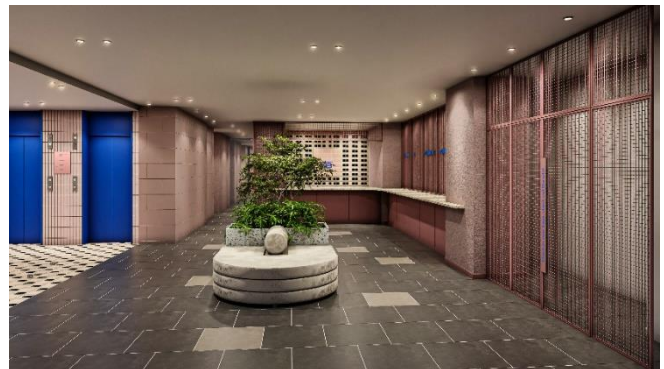
[First floor entrance]

Royal HD and Sojitz signed a capital and business tie-up in February 2021 to establish a strategic partnership. Together, the companies are engaged in overseas expansion of Royal HD’s restaurant business, café management business in Japan, and a platform business providing support for businesses opening restaurants, among other new business that leverage the strengths of both companies and span diverse fields.