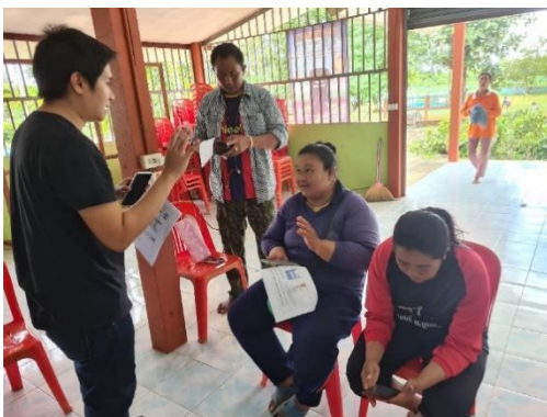
[Farmers receiving instruction on how to input agricultural data]

reduced cost in addition to farming advice and guidance with the aim of raising crop yield. Using a crop growth simulator, farmers can receive data-backed solutions that recommend the right fertilizer type, amount, and timing of application based on soil and meteorological data. In addition, Sojitz's in-house developed app gathers data from users on farmland and farmers' equipment, growth conditions for crops, and harvest volumes. Based on this data, KDX plans to enable farmers to use the agri platform to receive recommended services and products from agricultural product processing companies, farming material and equipment manufacturers, and financial institutions.