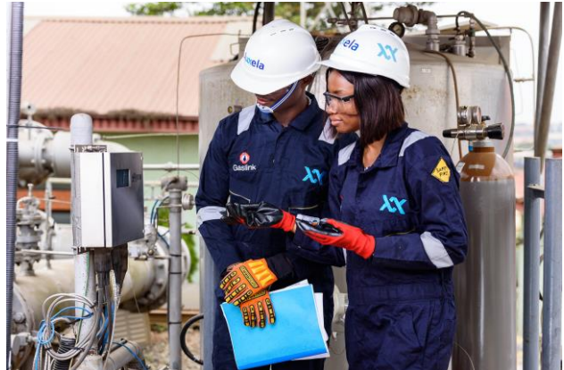
[Careful pipeline maintenance and management]