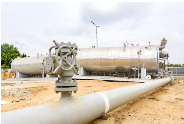
[Pipelines operated by Axxela Group]