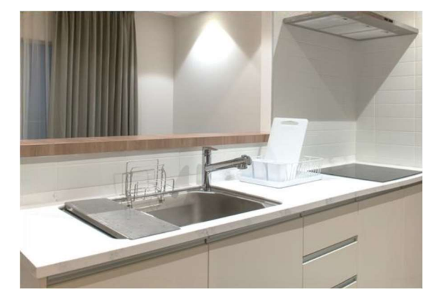
System kitchen made to Japanese specifications