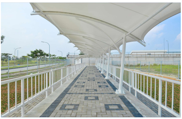
Dedicated school footpath (photo taken from the facility)