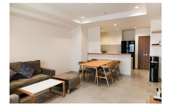
Interior view of an apartment