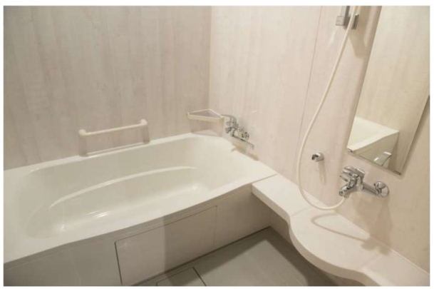
Unit bathroom made to Japanese specifications