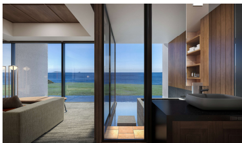
(Guest room 1)