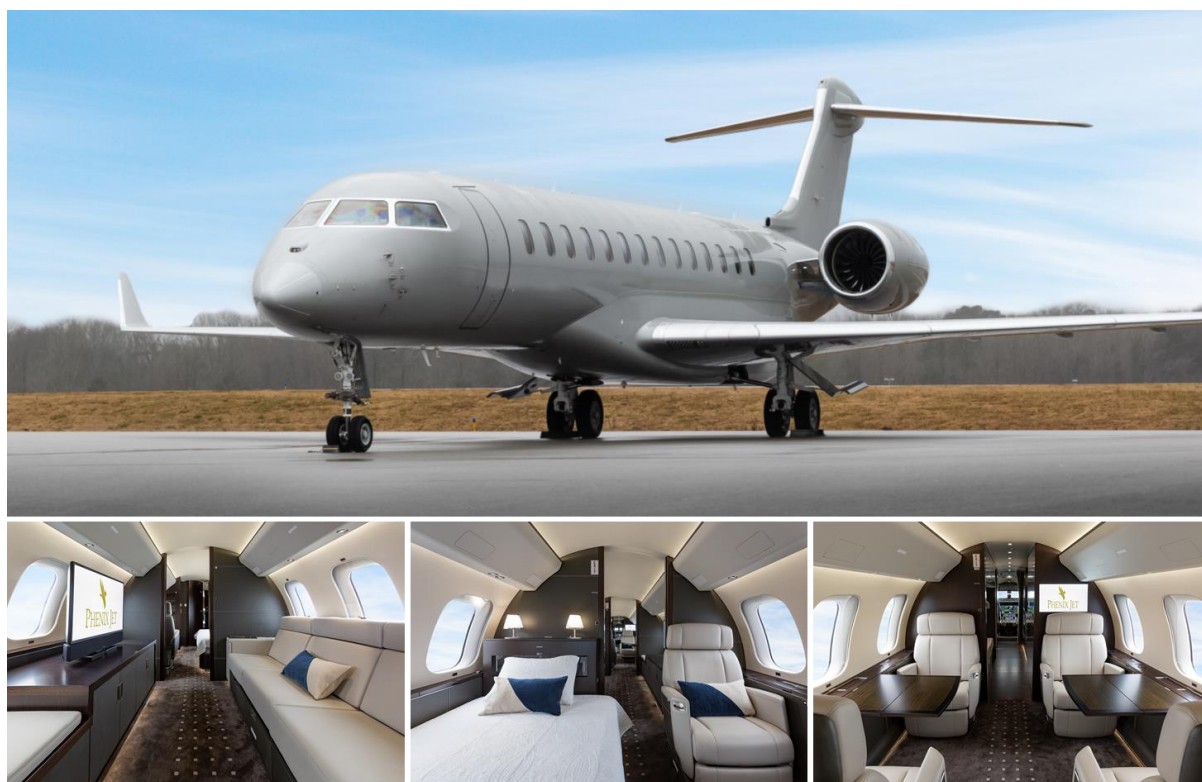
[Bombardier's New Global 7500 business jets]

*Depending on the weather conditions and number of passengers, non-stop flights may not be possible in certain cases.