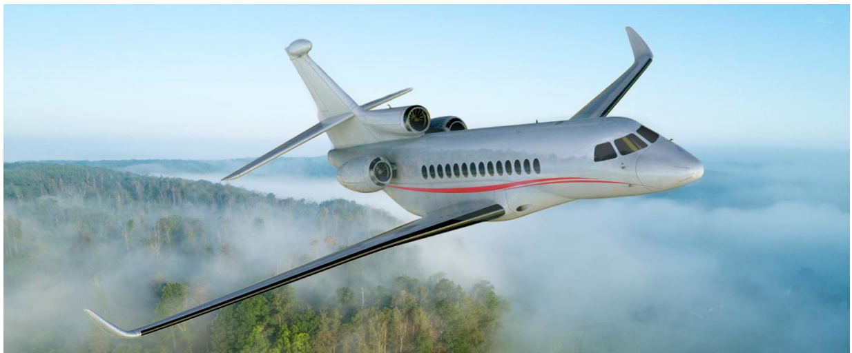
[Dassault Aviation’s Falcon 7X]

Sojitz Corporation (“Sojitz”) has begun offering business jet charter services (non-scheduled charter flights) for Cayman Island registered aircraft in order to meet diversifying client needs.