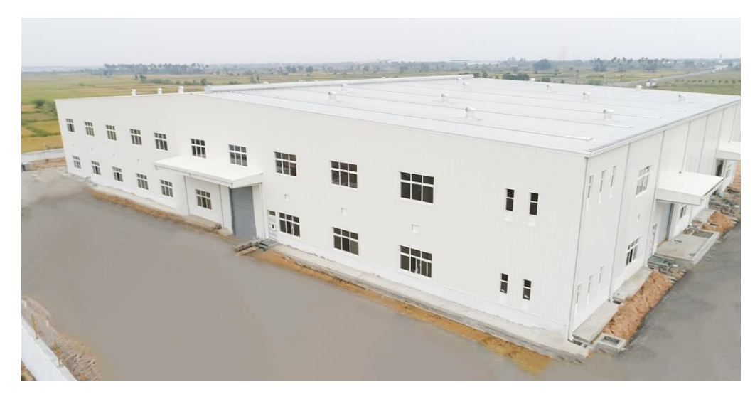
[Phase 1 Rental Factory]

SMIP's phase 1 factory has rental spaces starting from 1,000 m<sup>2</sup>. The factory spaces are ready to start production immediately, and SMIP provides companies with the benefit of lowered upfront expenses. In addition to its rental factory spaces, SMIP provides Land plots at sizes up to 10 ha (100,000 m<sup>2</sup>). All plots are equipped with basic infrastructure such as electricity and plumbing.