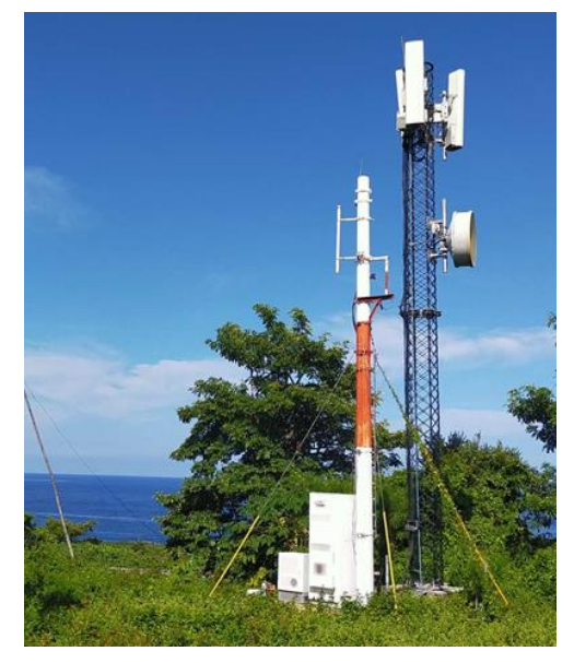
[Usage on islands and coastal areas (12 meters)]