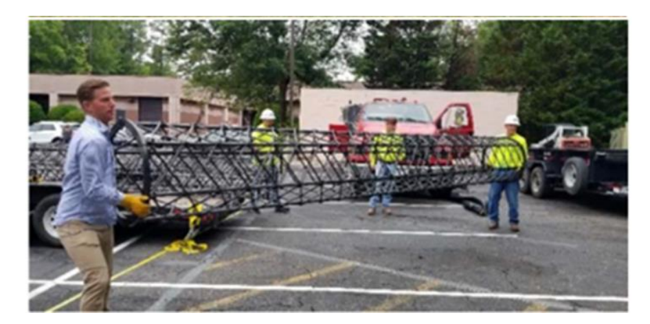
[IsoTruss Inc.'s lightweight, lattice structure tower (6 meters)]

These IsoTruss features are expected to be advantageous as disaster-resistant structures in Asian regions where typhoon-related tower damage is foreseeable. These structures will be used in coastal areas where salt damage often occurs, as well as in island areas where transportation can pose a challenge. Additionally, with the rollout of 5G, IsoTruss structures are anticipated to help meet growing demand in urban areas for rooftop and monopole towers.