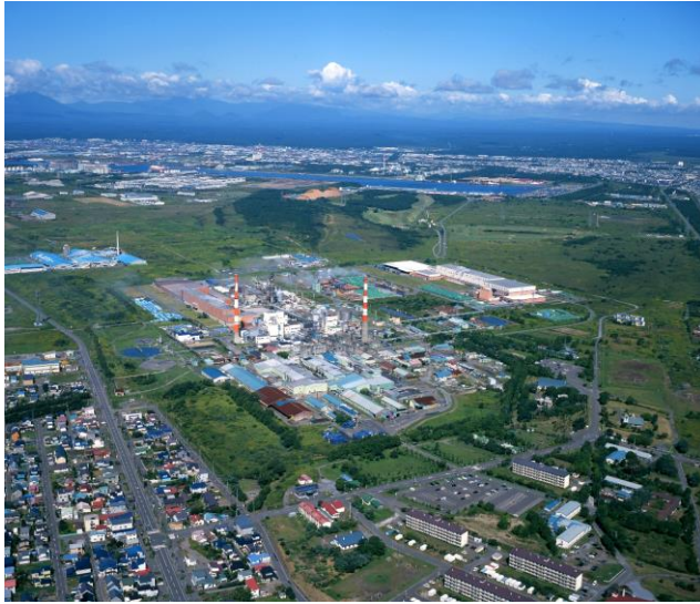
[Company / Project Overview – Yufutsu Energy Center, LLC