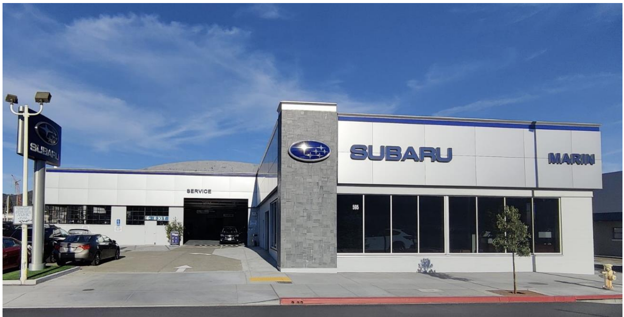
[Showroom at Marin Subaru]

Sojitz Corporation (“Sojitz”) has newly established Marin Sunwise Motors, Inc. (“Marin Sunwise Motors”) to acquire franchise rights and assets for Marin Subaru, an authorized dealership for Subaru brand vehicles in California. Sojitz has now begun sales operations at the Marin Subaru dealership.