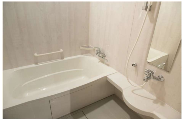
Unit bathroom made to Japanese specifications