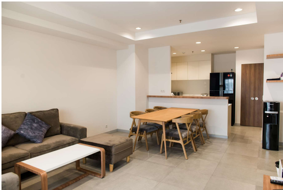
Interior view of an apartment