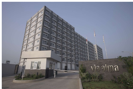
Exterior view of the apartments