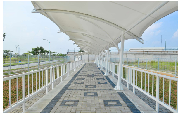
Dedicated school footpath (photo taken from the facility)