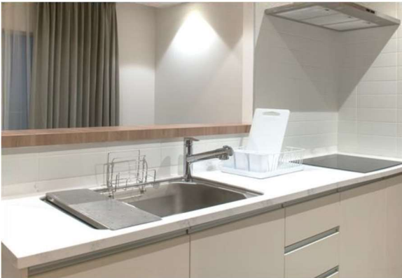
System kitchen made to Japanese specifications