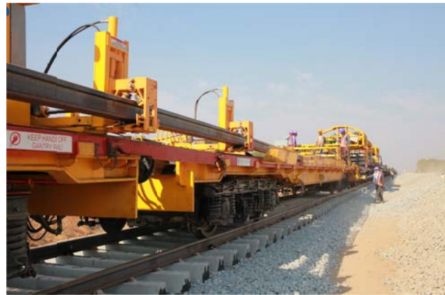
[At the track laying site]

The West DFC stretches almost 1,500km from the Indian capital of Delhi to the country’s commercial hub in Mumbai. Of that, the civil and track works on the 289km between the cities of Ikbalgarh and Vadodara in Gujarat, as well as electrification works on the 422km between Vadodara and Maharashtra’s Jawaharlal Nehru Port (JNPT), is expected to begin in FY2016. These contracts add another large sum of ODA to the project, following previous contracts for civil and track works (¥110 billion) and electrification works (¥50 billion) received in June 2013 and November 2014, respectively. Sojitz’s various West DFC projects now total ¥270 billion.