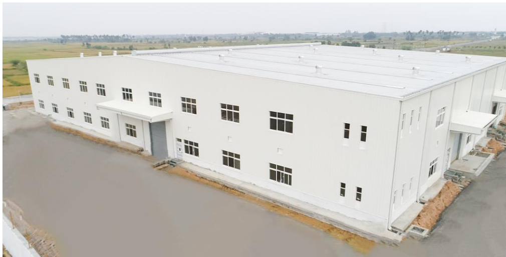
【Phase 1 Rental Factory】

SMIP’s phase 1 factory has rental spaces starting from 1,000 m 2 . The factory spaces are ready to start production immediately, and SMIP provides companies with the benefit of lowered upfront expenses. In addition to its rental factory spaces, SMIP provides Land plots at sizes up to 10 ha (100,000 m 2 ). All plots are equipped with basic infrastructure such as electricity and plumbing.