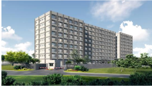
A view of the apartments from the north side