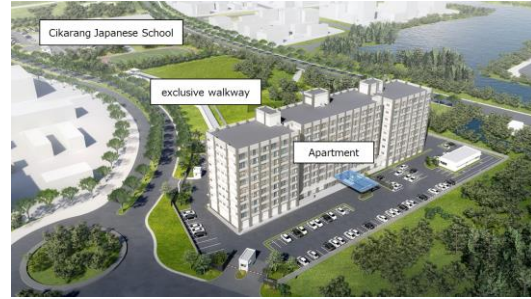
A view of the path to the Japanese school