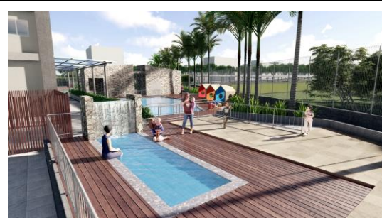
Outdoor kids' pool