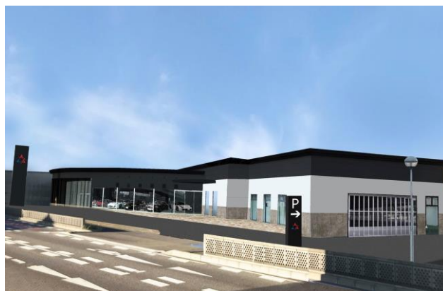
[Concept image of the Nagoya showroom]

The Nagoya branch currently sells pre-owned luxury brand vehicles. Sojitz possesses many years of experience operating authorized auto dealerships in Japan and overseas. Utilizing this expertise and Sanwa Service’s networks, Sojitz is now entering the Tokai region to further build upon the stable earnings foundation of its car dealership business, a core focus area of the Automotive Division.