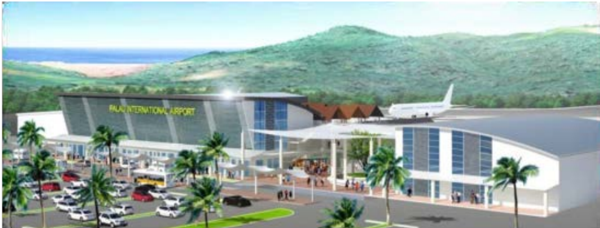
[Concept art of the completed Palau International Airport]

Through this project, Sojitz and Japan Airport Terminal aim to help create sustainable social and economic growth in Palau, a country for which tourism remains a core industry.