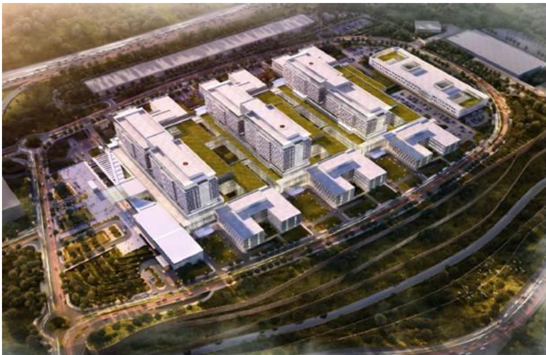
[Concept image of the completed facilities]

Sojitz Corporation has announced participation in a hospital project in Turkey via a wholly-owned subsidiary. Together with Ronesans, Sojitz will construct, operate and manage the Ikitelli Integrated Health Campus (Location: Istanbul, Turkey; the number of beds: 2,682; “Ikitelli IHC”). The Ikitelli IHC will be one of the largest hospital complexes in the world, and the sole hospital facility managed in part by a Japanese company.