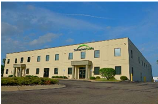
[Stratosphere Quality's Head Office]

Stratosphere Quality, like Green Tec, mainly provides quality assurance for parts and other products as a major service provider for automotive and auto parts manufacturers. Since its establishment in 2009, the company has continued to demonstrate high growth, and maintains a customer base in North America comprising close to 3000 companies.