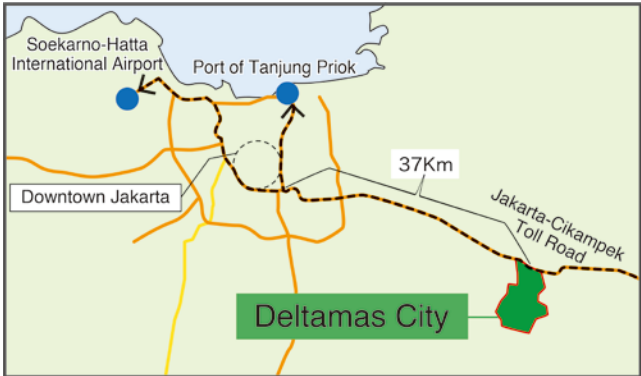
Map of Deltamas City Location

Deltamas is located within a city center roughly 37km from Jakarta that is home to government offices such as the Bekasi Regency and educational institutions such as the Institut Teknologi Bandung (in the planning stages.) Additionally, Deltamas City plans to open the largest Aeon mall in the ASEAN region and continue to develop the area into an attractive city, fully-equipped with urban infrastructures.