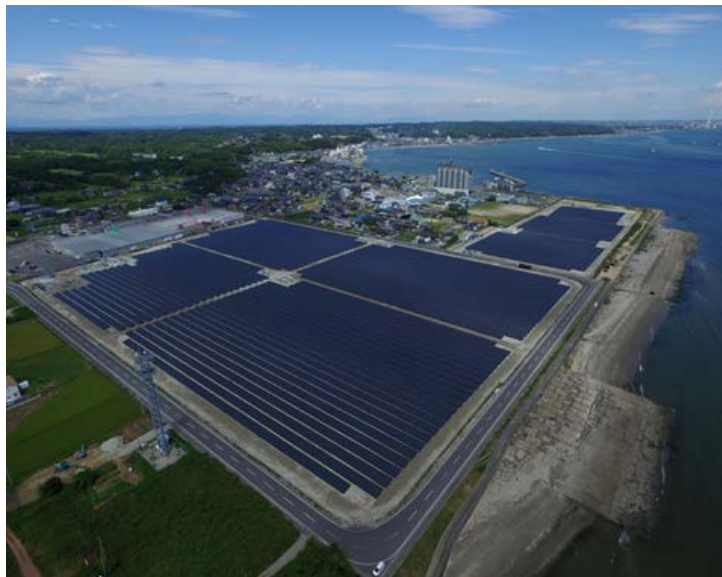
[Chita Mihama Solar Power Plant]