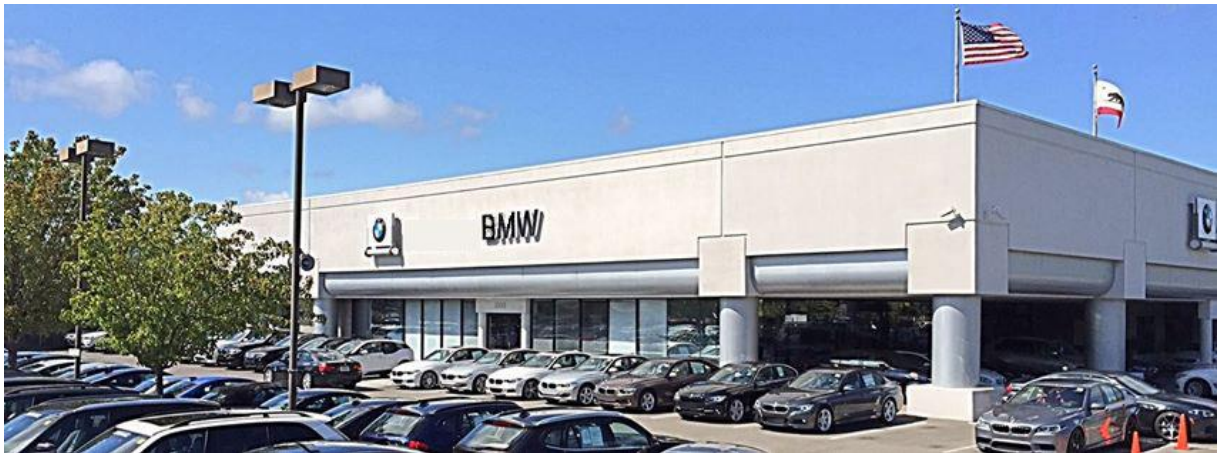
BMW of San Rafael (formerly Sonnen BMW) Center Facility

Sojitz Corporation (“Sojitz”) has acquired the franchise rights and assets of Mill Valley Imports, Inc. (dba Sonnen BMW; “Mill Valley Imports”), an authorized BMW brand dealership in San Rafael, California.