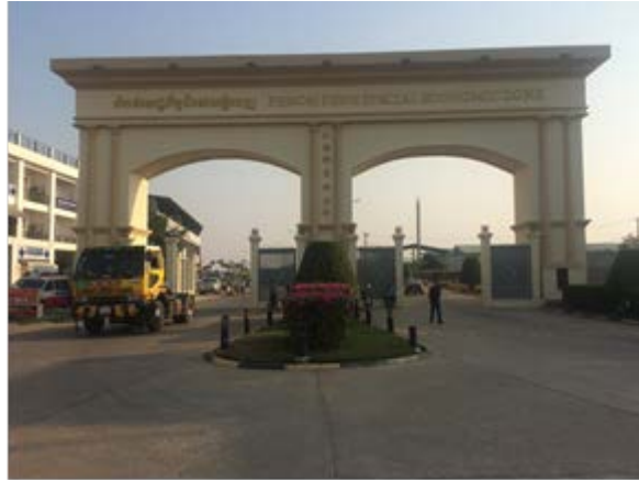
【Phnom Penh Special Economic Zone】