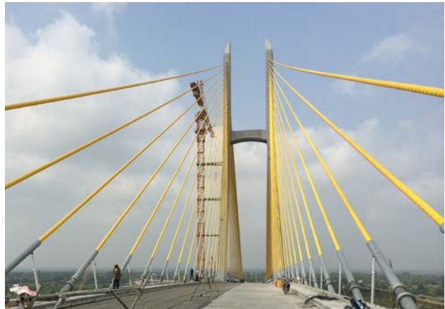
【Neak Loeung Bridge】