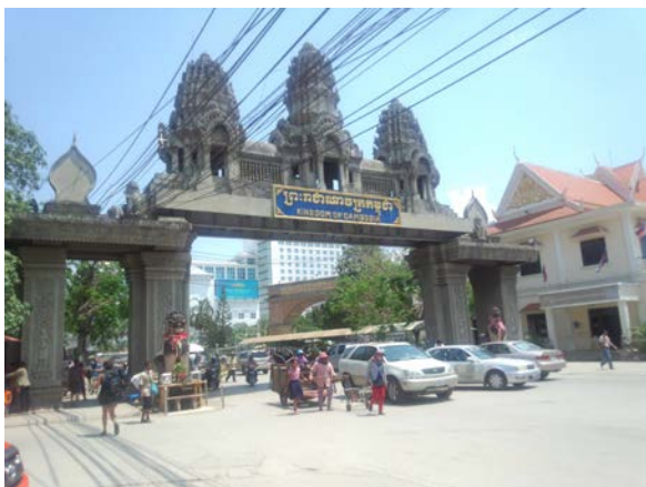
【Aranyaprathet, at the border between Thailand and Cambodia】