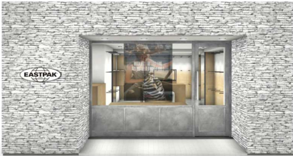
EASTPAK Tokyo Store

Sojitz GMC acquired exclusive import and sales rights for EASTPAK products in Japan from US-based VF Corporation in June 2012 and is currently selling products to sports shops, apparel select shops, bag shops, variety shops, and other retail establishments nationwide. Sojitz GMC is steadily expanding sales routes with a focus on apparel select shops and has set a target of reaching 1 billion yen in sales (retail basis) as soon as possible after the new store opens.