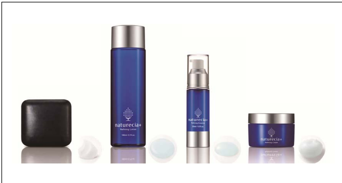
From the left: naturecia + soap, lotion, essence, and cream

Sojitz Cosmetics Corporation launch the naturecia + line of three-step skincare products consisting of soap, lotion, essence, and cream products. Sales will begin on September 18.