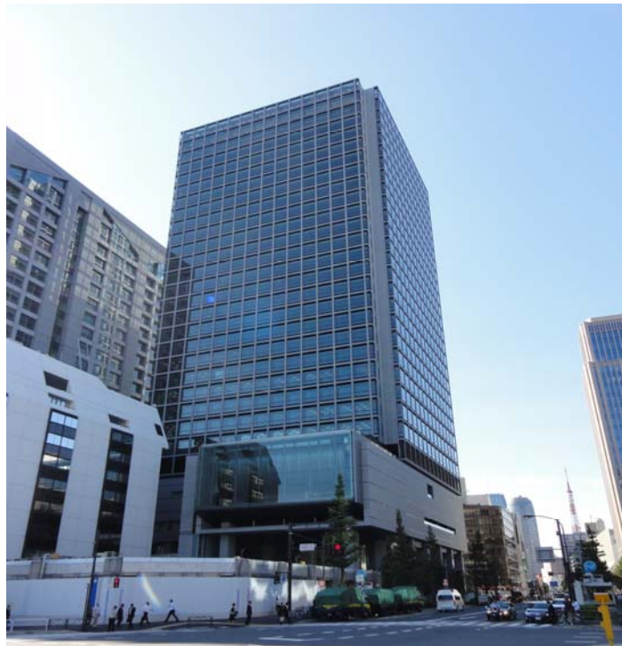
The lino Building, Sojitz's new head office site

The lino Building, the site of Sojitz's new head office, is a 27-story structure with five basement levels. Sojitz will occupy the 10 floors from the 17th to 26th stories. The new site has outstanding transportation access from nine subway lines at five stations. In addition, the lino Building is a green building with various environmentally-friendly features including LED lighting throughout.