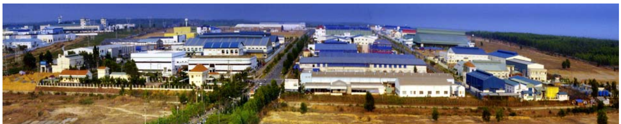
The Loteco Industrial Park, operated by Sojitz, is located near the Long Duc Industrial Park

Kobelco Eco established Kobelco Eco-Solutions Vietnam Co., Ltd. in 2010 and is utilizing the water processing and environmental facility know-how that it gained in Japan to engage in comprehensive business development in Vietnam including after-sales services. For the Long Duc Industrial Park too, Kobelco Eco will offer total solutions such as facilities that minimize environmental impact and after-sales services that comply with local environmental standards.