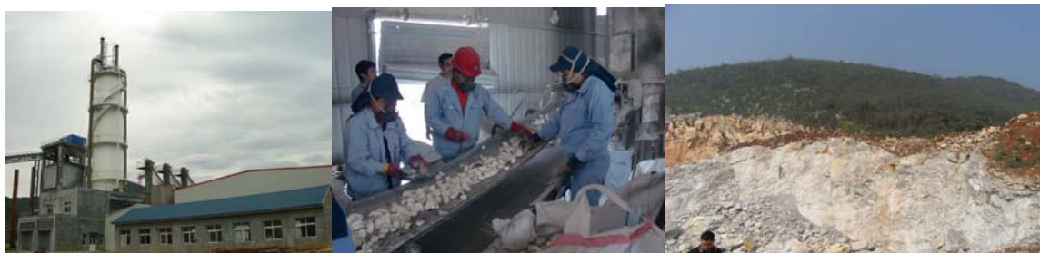
Sunland's lime production plant and limestone mine

Sojitz, Ube Material and Sunhill (Hong Kong) Investment Limited, Sunland's parent company, will establish a new holding company called Sunlime Ltd. with Sojitz and Ube Material holding a combined 51% interest (43.77% by Sojitz and 7.23% by Ube Material). Total investment will be $8.5 million (approximately 700 million Japanese yen).