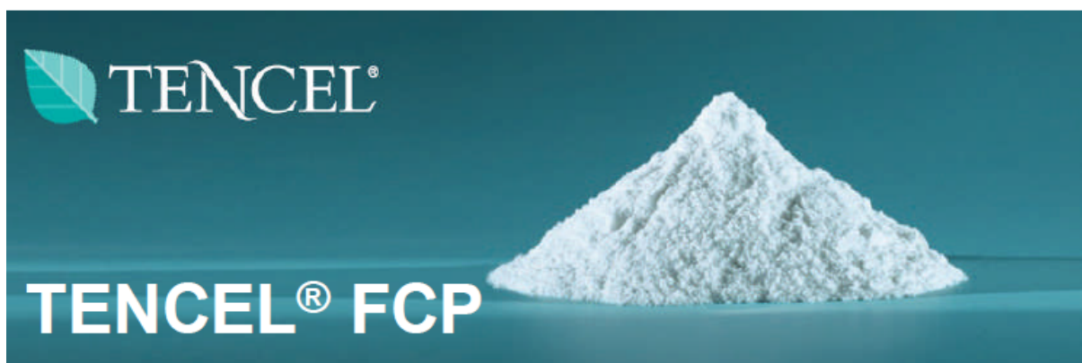
<Bio-resin compound material using TENCEL®>

Under this plan, Sojitz will supply an automotive-use reinforced plastic compound material primarily made from eucalyptus-based TENCEL® fiber. The compound will be produced by Lenzing, which holds an independent manufacturing patent for the process. The eucalyptus timber used as the raw material will consist of rapid-growth tall trees, for which the low volume of water required for growth (1/70 th that of cotton) will dramatically reduce the environmental load as well. These raw materials will be specially supplied from a contracted plantation for processing into fiber through an original and eco-friendly production method. In comparison to conventional compound materials, this version promises to make an impressive contribution to reducing carbon dioxide emissions, further easing the burden on the environment. Sojitz plans to start up this bio-resin compound business in 2011, marking its first entry into this particular field in Japan.