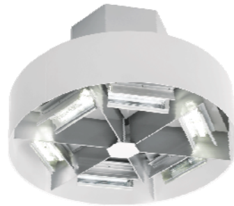
High Bay Lighting