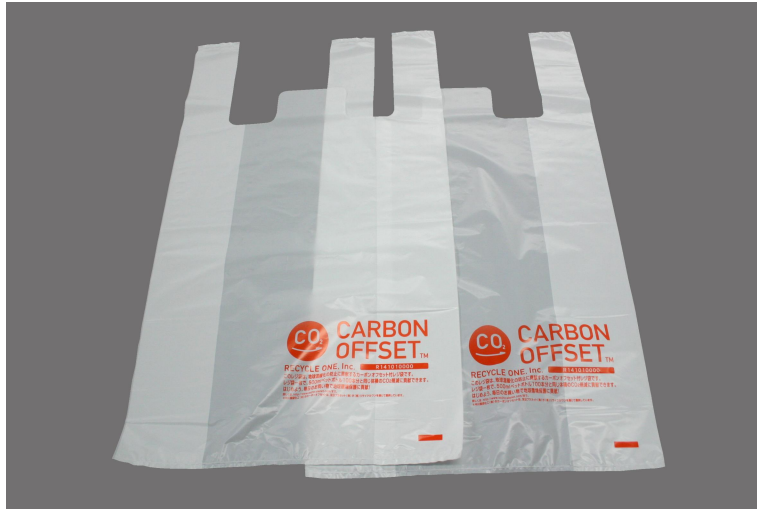
【Plastic Grocery Bags with Carbon Offsets】