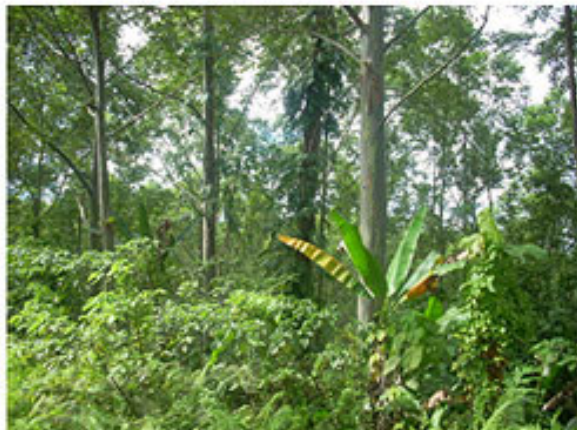
New Georgia Island, the site of EPL's tree plantation in the Solomon Islands