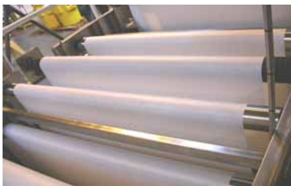
Resin coated membranes