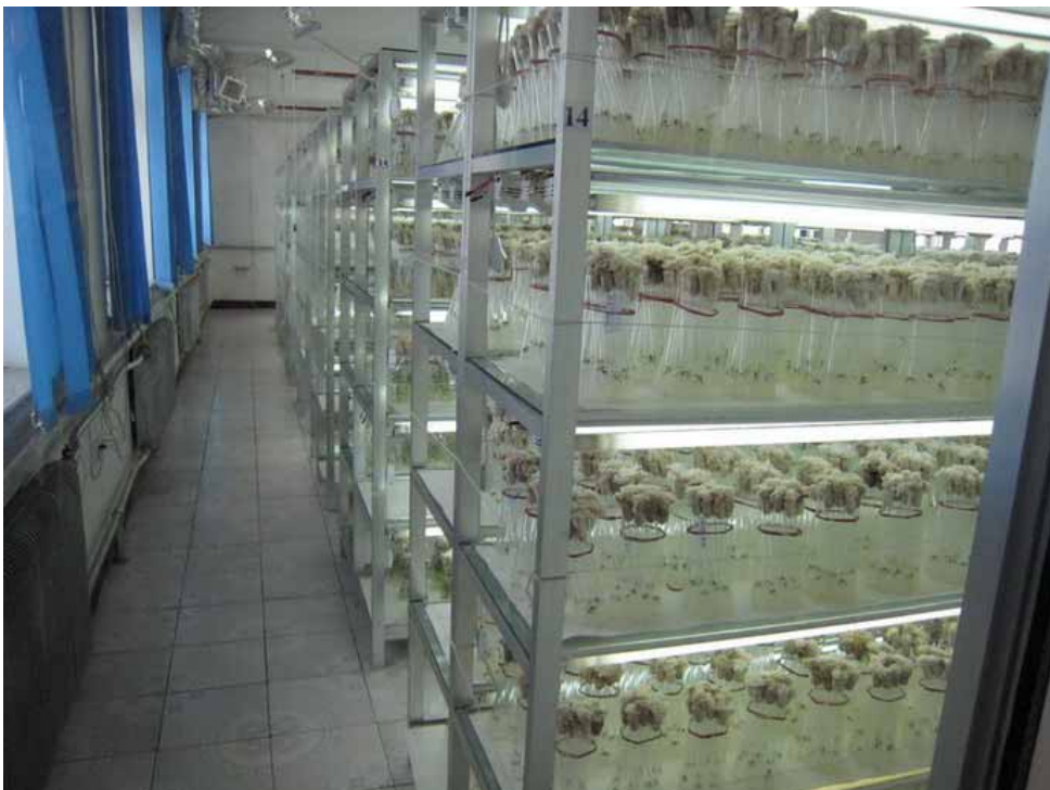
Seed potato culture center at Keshan Farm