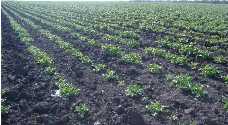
Land at Keshan Farm cultivated for potato production