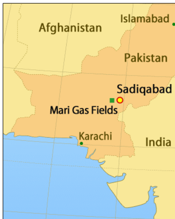
Fertilizer Plant Site (in Sadiqabad)

Pakistan is pursuing the maintenance and fostering of agriculture, which is the country's main industry. The country has adopted a priority-based policy for the allocation of its natural gas as an ingredient in fertilizer production. Further, there is active demand for fertilizers in Pakistan, and the construction of new plants, the expansion of existing plants, and the updating of old facilities there are intensifying. Sojitz has established a relationship of mutual trust with the Fatima Group over twenty years of trading, and the company continues not only to aim at receiving orders for plants for Pakistan, but also to focus on the Asian markets.