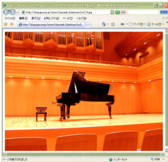
[Seat close to the stage; one can almost hear the artist breathing.]

When one clicks 'View the stage from your seat', another window will appear and display a photograph of how the stage can be viewed from that particular seat.