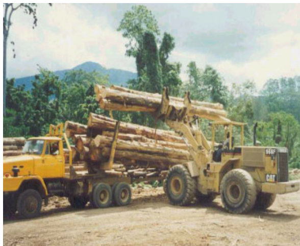
KFPL plantation forest and log yard in the Solomon Islands