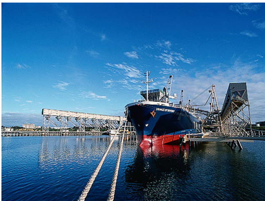
Woodchip loading in Australia