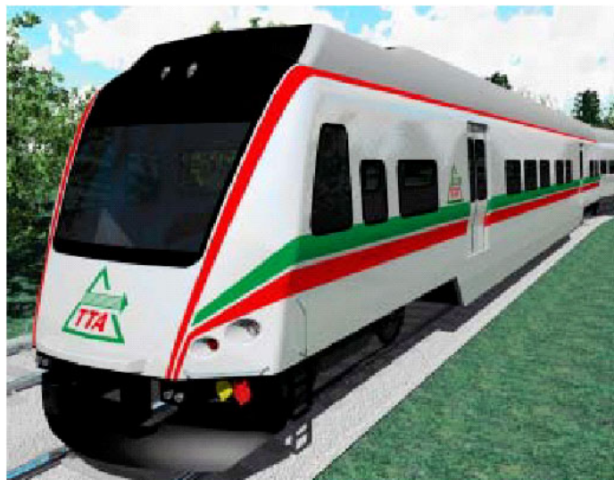
Conceptual drawing of the rail cars to be delivered to the Triangle Transit Authority

The diesel rail cars to be delivered by the Sojitz Group will have the most advanced specifications, which are in compliance with the latest American railroad standards and which respond to US emission controls from the year 2008. It is planned that the diesel rail cars will have a maximum speed of 125 km/h, and that each car will have 80 seats. This project is subject to the BUY AMERICA requirements, as it was funded by the US Federal Government. The final assembly of the coaches will therefore be carried out at the factory in Philadelphia City.