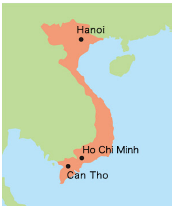
Map of Vietnam

Sojitz Corporation received an order for a thermal power plant construction project jointly with Korea's Daelim Industrial Co., Ltd. from Vietnam Electricity (EVN). The project has an order amount of approximately 28 billion yen. The O Mon No. 1 Thermal Power Plant Unit 2, which EVN plans for Can Tho City, will have a generating capacity of 300 MW and is expected to be completed and start operation in 2015.